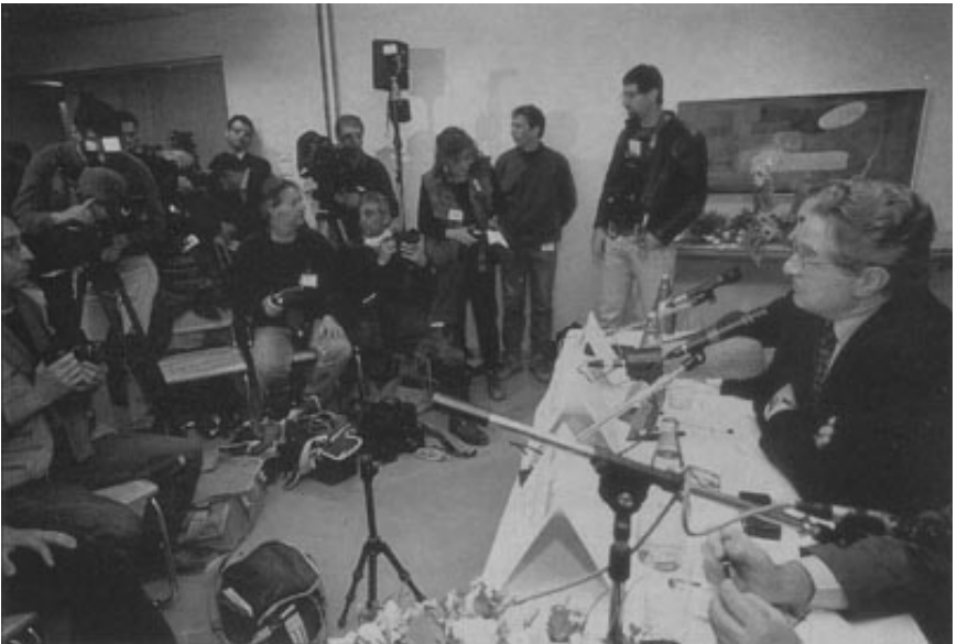
A secretive, mysterious figure for a long time. Soros, by the early 1990's, was pleased to appear at press conferences as a way of promoting his philanthropic activities.