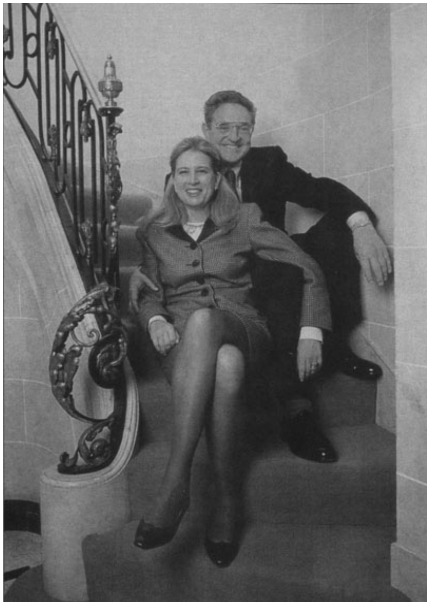
Soros and his wife Susan in a relaxed pose.