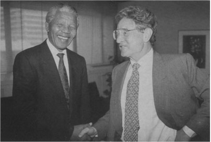
Soros, eager to burnish his image of “world statesman”, talks here with South African leader Nelson Mandela.