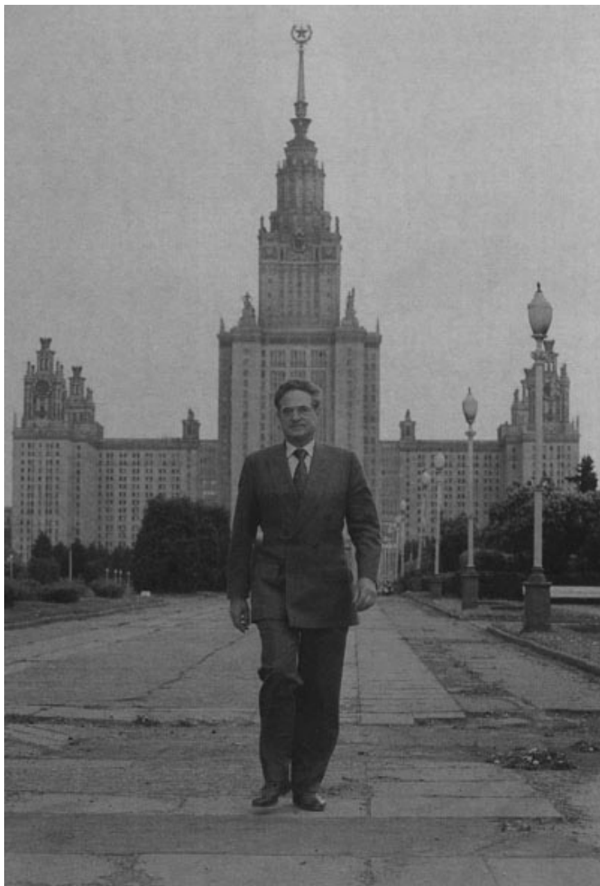
Despite strong concerns over Russia's future, Soros has provided much aid to the former Soviet Union. Here he is shown in Moscow.