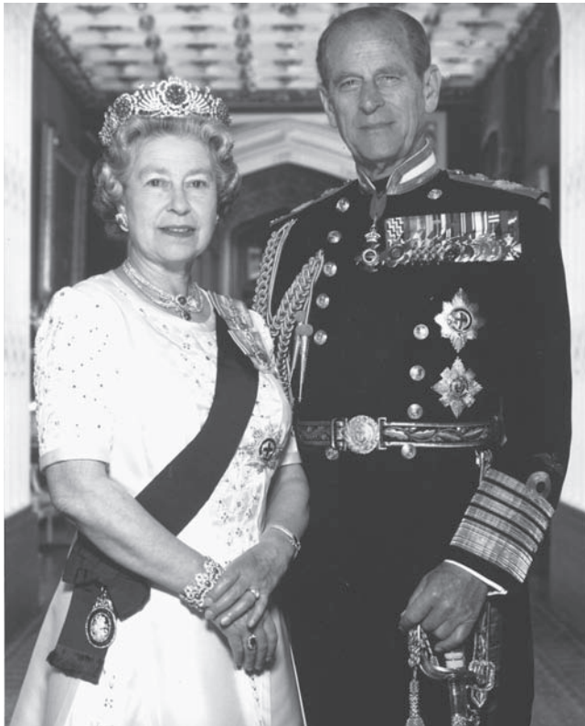
Official portrait taken at Buckingham Palace, Her Majesty Queen Elizabeth II and His Royal Highness Prince Philip, the Duke of Edinburgh

predators, on Her Majesty Queen Elizabeth II's yacht Britannia. 2