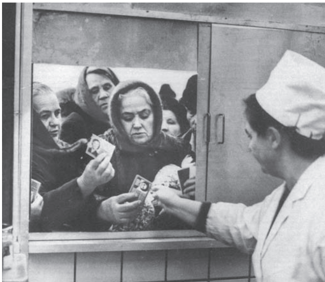
Soviet women show ration cards to buy food. Ogonyok 1991.

the coming two years will decide the fate of all humanity for a century or more to come... The time has come for a bold decision on U.S. policy toward Central Europe." At that time, the LaRouche Movement was recruiting from the influential circles throughout Eurasia around the prospect of building the Productive Triangle and later the Eurasian Land Bridge to transform the region into a prosperous community of nation-states.