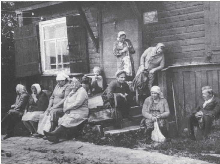
Russian peasants. Ogonyok..