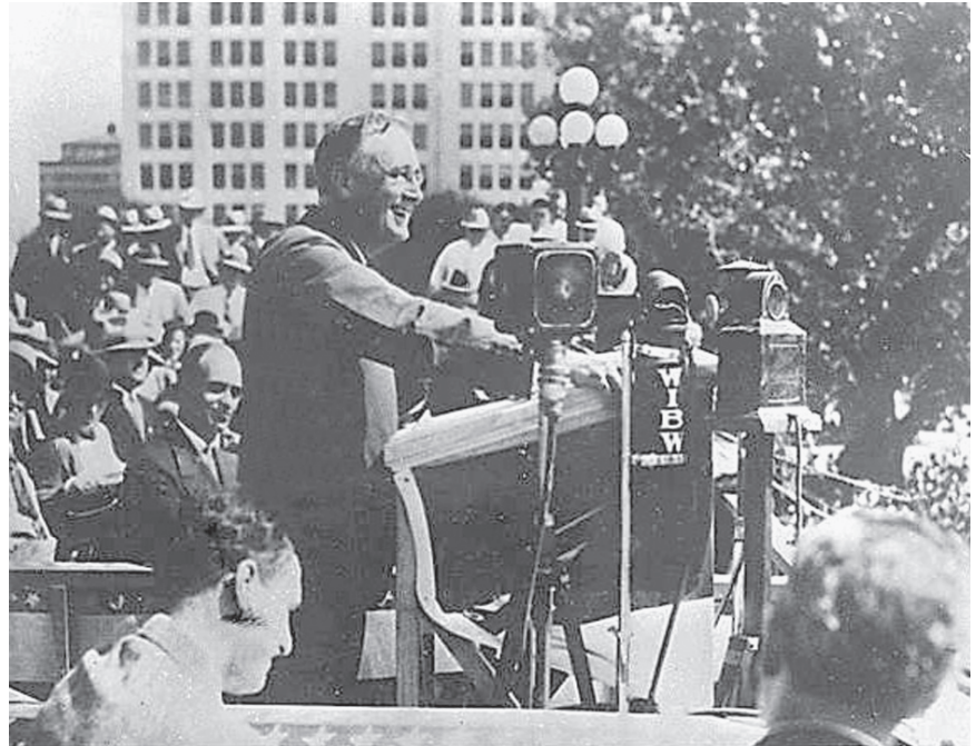
Franklin D. Roosevelt's nomination as the Democratic candidate for President was far from assured when the 1932 convention met in Chicago; it took four ballots, and a knock-down drag-out political fight against the London-Wall Street interests who backed FDR's opponents. He is shown here campaigning in Kansas in 1932.

Most Americans, with even a slight degree of historical literacy, know these basic facts about the election of 1932. Few, however, know how close the nation came to a disaster at the Democratic nominating convention in Chicago; how close FDR came to being deprived of the Presidential nomination, despite