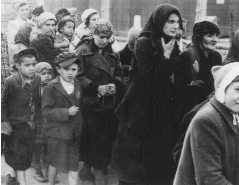
Hungarian Jews on their way to the gas chambers. Auschwitz-Birkenau, Poland, May 1944.