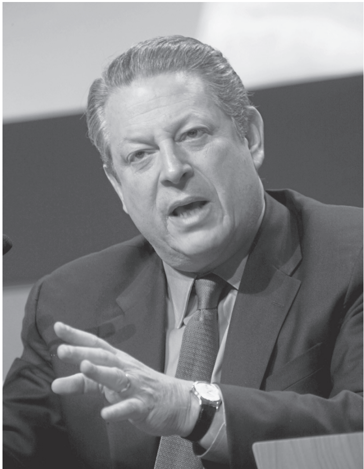
Al Gore at the Davos meeting in January 2008.

then foreign minister Abdullah Badawi, sent the US a heated letter of protest, warning that the United States would be held accountable for inciting instability.