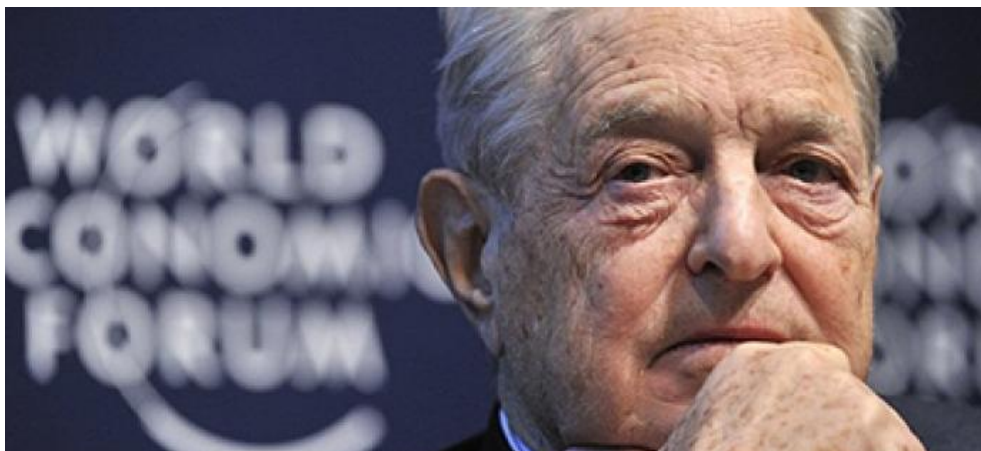
Davos: A Hungarian-American financier George Soros.

Ukraine's leading political party has said that the international financier George Soros has been preparing a "Libyan scenario" for the country.