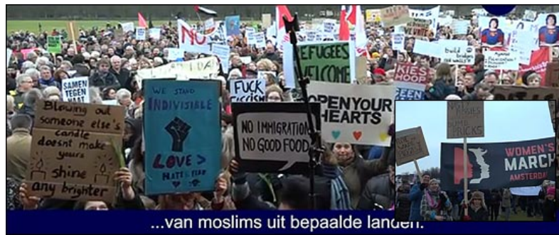
...van moslims uit bepaalde landen.