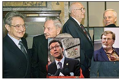
Attorney general Bob Ferguson (small, mid) and Judge James Robart (small, right), both responsible for blocking Trump's executive order to ban Muslim refugees from a number of countries from entering the U.S. Both Ferguson and Robart maintained very close (financial) ties to Bill Gates, Sr., visible here (second from right) with other anti-Trump financiers: George Soros, David Rockefeller and Ted Turner.

I didn't pay much attention to the case until reading that only a few months earlier Robart had shut down a case involving Seattle police reform with the statement " black lives matter! " He was utterly irrational in his closing statement, ignoring severely higher black crime numbers to make the case that black people are persecuted minorities. So I checked his background and in no-time noticed his trusteeship and chairmanship of Whitman College, which has been repeatedly financed by the Bill & Melinda Gates foundation during his tenure. And guess what? The Seattle Children's Home and the Children's Home Society of Washington, which Robart respectively served as president and trustee of, have received large sums of money from not just the Gates Foundation , but also the MacArthur Foundation and other big interests. There's also Robart's old law firm, Seattle's Lane Powell PC, which has clients as Microsoft and just about every other American multinational, many of which support pro-Third World immigration NGOs.