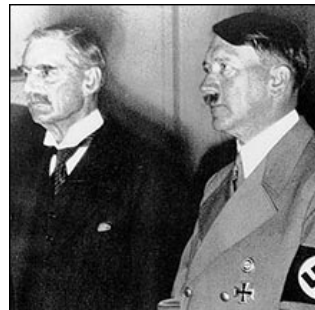
Hitler with Neville Chamberlain. Supposedly Chamberlain "appeased" Hitler out of fear for another war, but history books have failed to notice that he and his family were deeply involved in Imperial Chemical Industries, General Motors and Du Pont, just three ( Pilgrims-tied ) corporations that helped build Nazi Germany's war machine.

Because like it or not, the white tribe is making up an ever smaller portion of the global population and, especially in Europe, is rapidly giving its living space away to a hodgepodge of Third World societies - some openly hostile to the West - that have never able to get their own houses in order. We essentially are the only tribe that is doing that. Our open-mindedness and sense of social justice is our greatest strength, but if balance is lost because our actions come from a place of weakness where we don't dare to say "enough is enough", it can also result in our ultimate downfall.